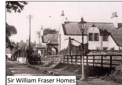
Sir William Fraser Homes

Continue up Spylaw Bank Road and in about two hundred yards on the right, you pass the Sir William Fraser Homes. These were designed in 1898-99 by