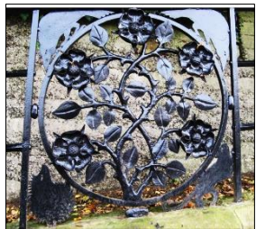
A section of the railings on Bridge Road

Turn right up Spylaw Street. At the junction with Bridge Road is a cottage at No. 24 Spylaw Street. This was once the local police station.