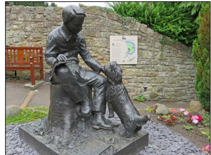
Statue of Robert Louis Stevenson

The walk is approximately 1.2 miles long, on a mixture of surfaced pavements, quiet roadway and good but unsurfaced footpaths. The route includes steps and a steep uphill section.