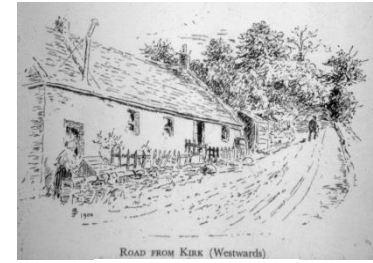
ROAD FROM KIRK (Westwards) Spylaw Bank Road

Leave the churchyard and climb up Spylaw Bank Road. The cottages on the left retain their rural charm. No 1, opposite the Church entrance, is a listed building, while the cottage next door was thatched for many years. This hill was known as Kirk Brae and Hailes Brae.